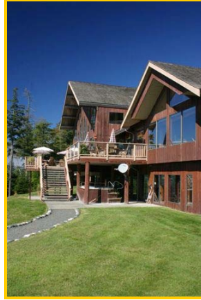
Main Lodge Terrace