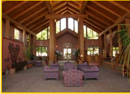
The Grand Hall