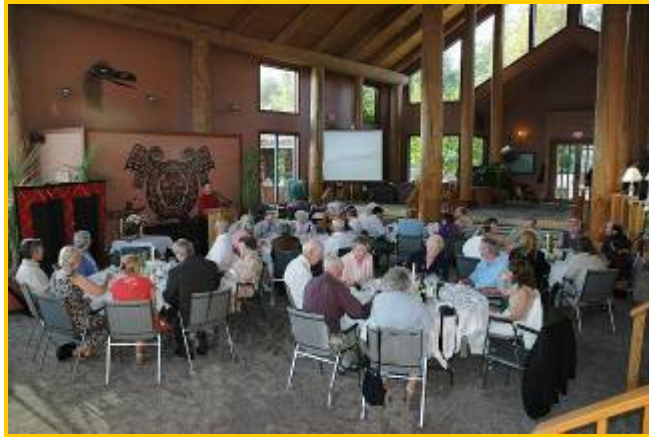
Banquet in the Grand Hall