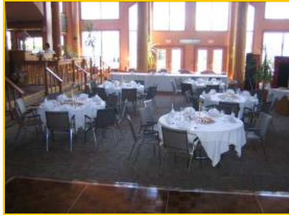
Photos of the Grand Hall set up and ready for a special occasion